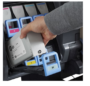
HP Latex Optimizer Achieve high image quality at high productivity:

Interacts with HP Latex Inks to rapidly immobilize pigments on the surface of the print