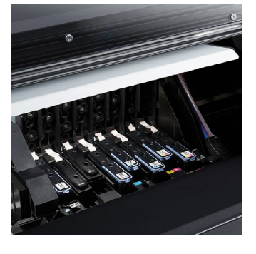
HP 831 Latex Printheads Experience high-productivity printing:

Interacts with HP Latex Inks to rapidly immobilize pigments on the surface of the print