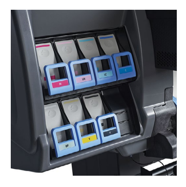
HP 831 Latex Inks Take advantage of the versatile, durable performance of HP Latex Inks:

The HP Latex 330 Printer features a number of significant innovations that take you beyond the limits of eco-solvent printing, creating new opportunities to expand your business.